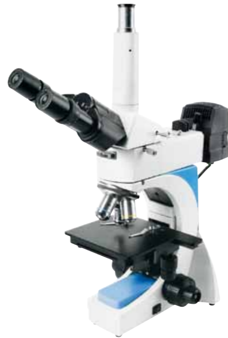
NF - 102A 金相显微镜 NF - 102A Metallurgical Microscope