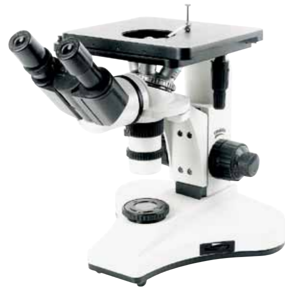
NF - 100 倒置金相显微镜 NF - 100 Inverted Metallurgical Microscope