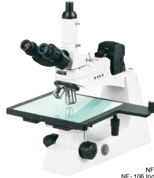
NF - 106 工业检测显微镜 NF - 106 Industry inspection Microscope

Metallurgical microscope is suitable for appraise and analysis the structure of various metal, alloy material and non-metal material. It is widely used in electronics industry, chemical engineering and instruments and meters to observe surface of the opaque material; chip, PCB, LCD, wire, fiber, plating and other non-metal material. with infinitive optical system providing excellent optical functions. The instrument can also used in biological study with the incident and transmitted illumination, imaging and observing system.