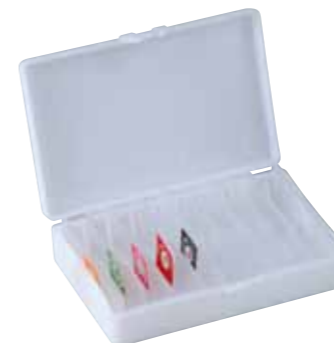
塑料切片 Plastic slide