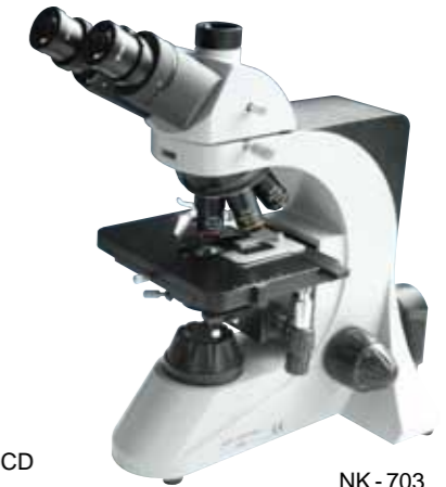
NK - 703