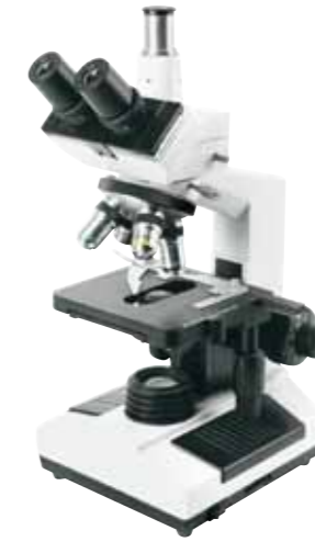
NK - 107CCD