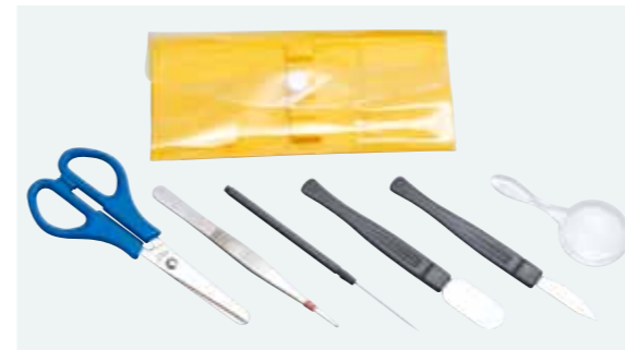
解剖工具 Dissection set