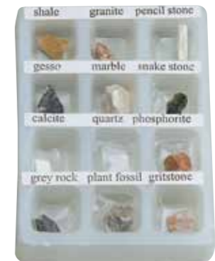
矿石标本 Mineral sample