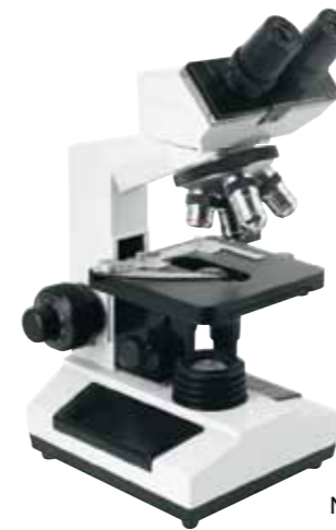
NK - 107