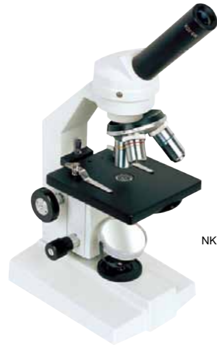
NK - 103A