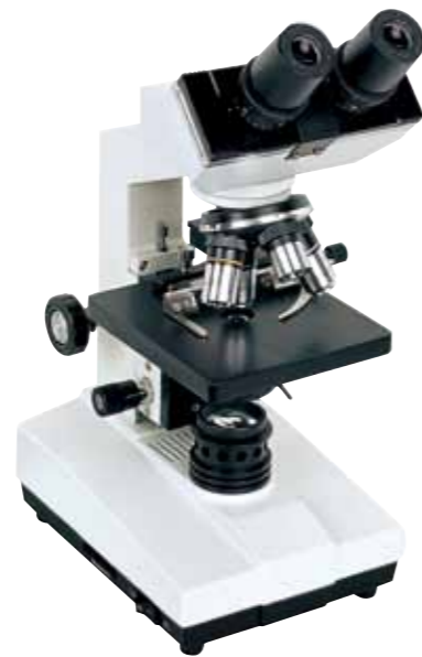
NK - 103C