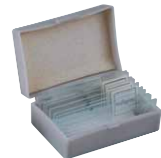
玻璃切片 Glass slide