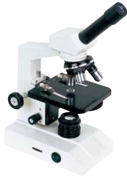
NK - 103B